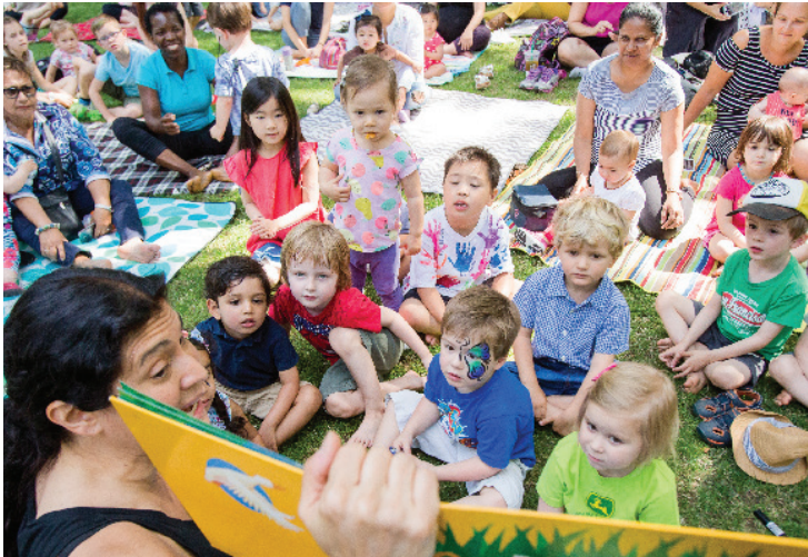
Our kids yoga program on the lawn draws hundreds of kids meeting.

USP continues to expand event programming, and partnering with neighborhood businesses to offer over 198 community activities throughout Union Square. USP's 9-week series, Summer in the Square , was the most popular program indicated by respondents. This year with the support of Citi, USP expanded the number of activities and shows offered brought on higher caliber performances, and worked with a dozen new neighborhood businesses. USP's Harvest in the Square food + wine fundraiser and Union Square Sweat Fest , winter health + fitness program were also favorites, with the majority of respondents expressing a desire for more music + dance performances, movie nights, and fitness classes.