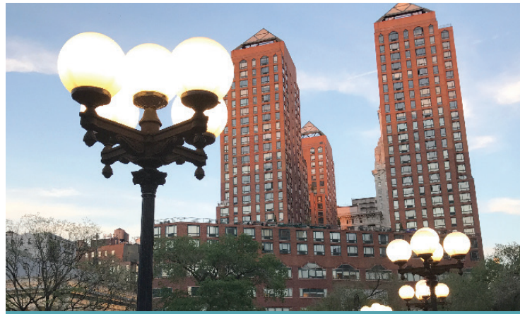
USP upgraded park lighting with 70 brighter, energy-efficient LED bulbs to provide greater safety in the park at night.

With more than 52,000 followers across USP's social media channels, there are more ways than ever to follow and join the conversation with us. 94% of respondents rated USP's marketing + communications efforts Excellent or Good, stating USP is doing a "solid job" and our "social media is phenomenal!" With over 8,500 email subscribers, USP's monthly newsletter was rated the most useful form of communication by over 80% of respondents. Over 95% are satisfied with the frequency of contact with USP and the community noted that the Union Square Partnership website, which received a mobile-friendly upgrade in August, was the second most relied upon communication tool. The majority of respondents indicated a strong desire to learn more about neighborhood events, dining recommendations + specials, and new business openings.