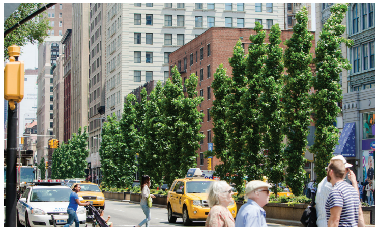
USP enhanced Union Square East with a new median mall landscaping design.

USP uses survey results to identify community needs, develop programmatic recommendations, and enhance transportation, safety, and sanitation services. We encourage you to contact us with any additional feedback and to follow us @UnionSquareNY. To learn more about our programs and services or to get involved with our work, contact us at 212.460.1200 or info@unionsquarenyc.org .