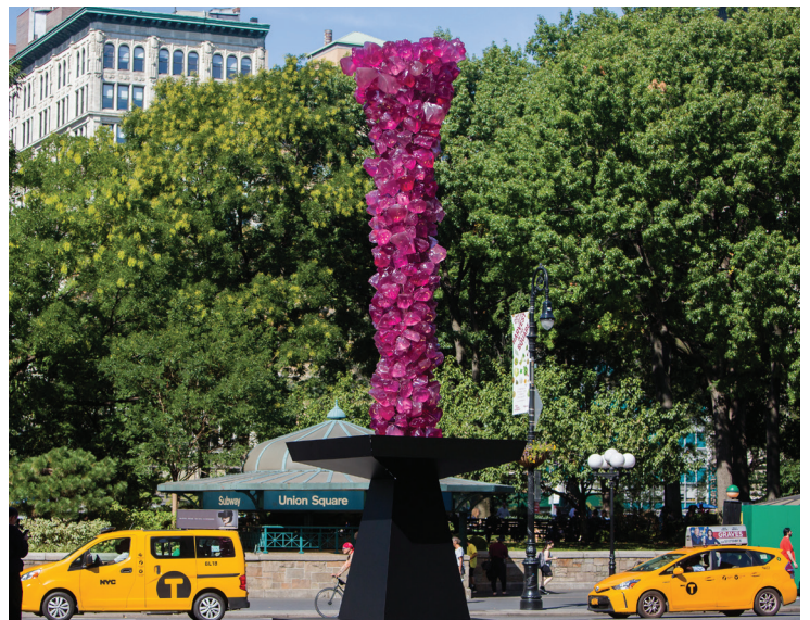
USP works with NYC Parks to feature critically acclaimed public art.

In partnership with NYC Parks, local property owner ORDA Management, and landscape designer HM White, USP overhauled the median malls with a beautiful and lush landscaping design which includes 80 new columnar Sweet Gum trees, shrubs, and perennials. This past spring, USP installed 600 new pieces of bistro furniture to expand public seating areas, noted as our most popular investment by respondents. Additionally, 89% of respondents commended USP on increasing safety through the investment in 70 brighter, energy-efficient LED park lights.