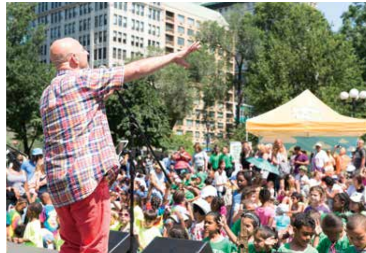
JUNE USP kicks off nine weeks of Summer in the Square with more free community programming than ever before.