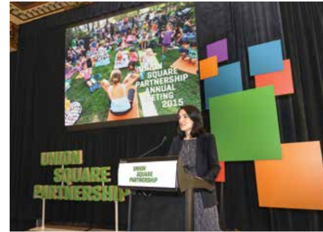
MAY USP hosts Annual Meeting & Networking Event highlighting the district's successes at the W New York – Union Square.