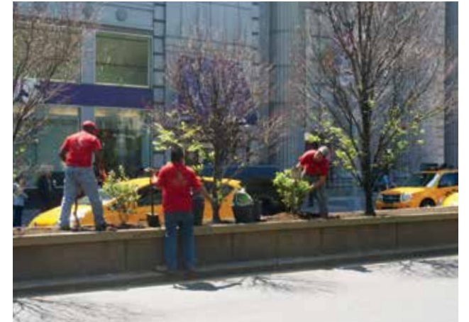
MAY USP expands our beautification efforts on the east side of Union Square Park with the beginning of our extensive landscaping project to improve the median lawns along Union Square East.