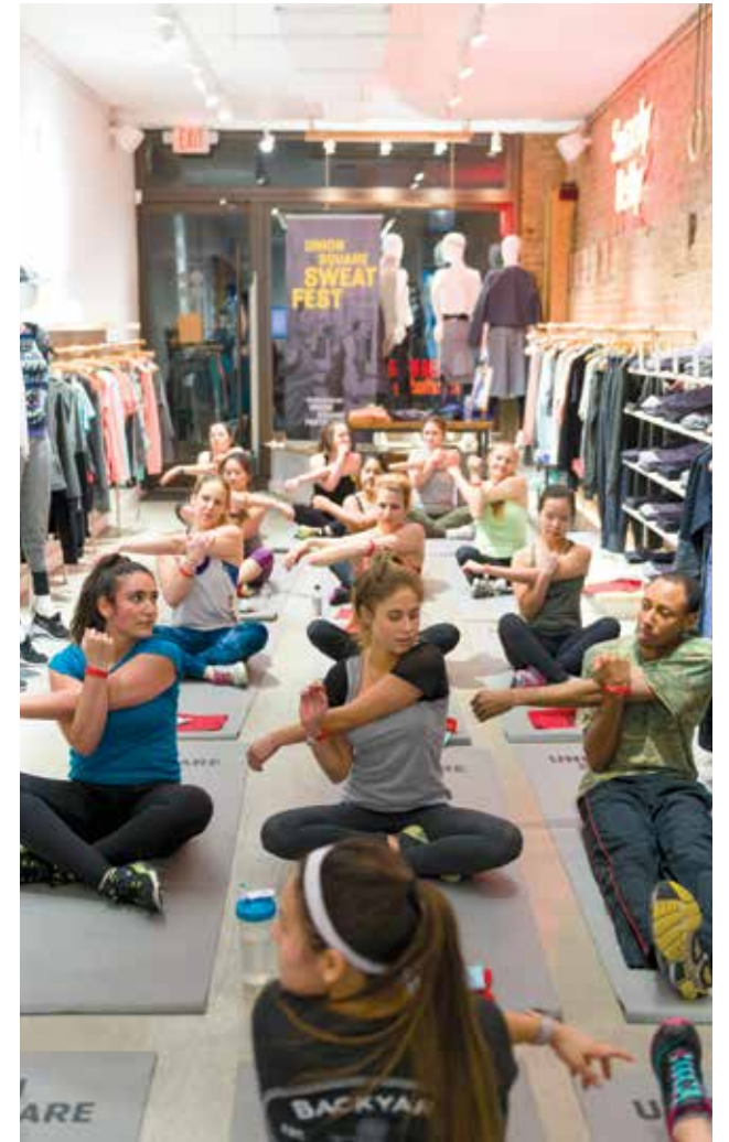
More than 900 fitness enthusiasts and 50 health + wellness businesses participated in the 2nd Annual Union Square Sweat Fest .

Harvest in the Square , which raised $350,000 for Union Square Park in 2015 and more than $5 million since the fundraiser began in 1996. Over 1,200 attendees came to enjoy unlimited samplings from over 45 of the neighborhood's best restaurants, each dish paired with regional wines and microbrews. To celebrate the holiday season, USP offered free professional portraits, refreshments and holiday entertainment at our 2nd Annual Picture Perfect Union Square . The festive gathering also marked the launch of the world famous Union Square Holiday Market , which drew more than 1 million visitors this holiday season.