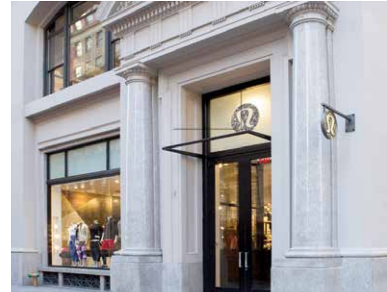
Athleisure retailers continue to flock to the district. Lululemon helped fortify the neighborhood's distinction as NYC's center of health + wellness with the debut of their 11,500sf flagship store featuring the retailer's first community space dubbed Hub Seventeen.

With several notable projects on the horizon, Union Square continues to attract new real estate development. Reading International has begun the redevelopment of the historic Tammany Hall on Union Square East. Leased by Newmark Grubb Knight Frank, the iconic property offers more than 75,000 square feet of retail and office space. Capitalizing on the growth of tech in the area, including the recent arrival of Buzzfeed, Facebook and WeWork, the City is redeveloping the P.C. Richard & Son site into a tech hub to support the neighborhood's growing digital economy.