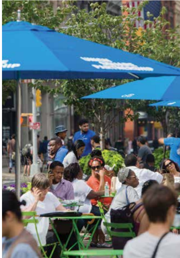
MAY Warm weather brings out thousands to enjoy USP's new shade umbrellas and complimentary Wi-Fi in public seating areas maintained by the organization.