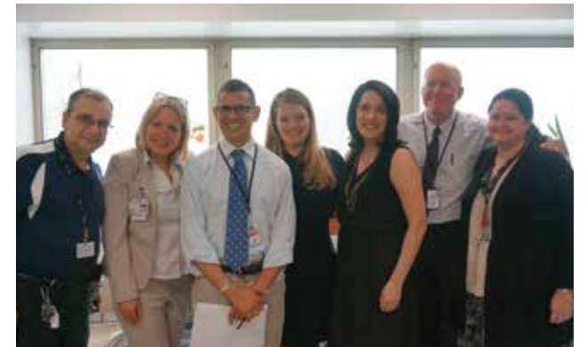
JULY Chef Driven, operators of Union Square Park's successful Pavilion Restaurant, partner with USP and the VA NY Harbor Healthcare System to deliver meals to veterans.