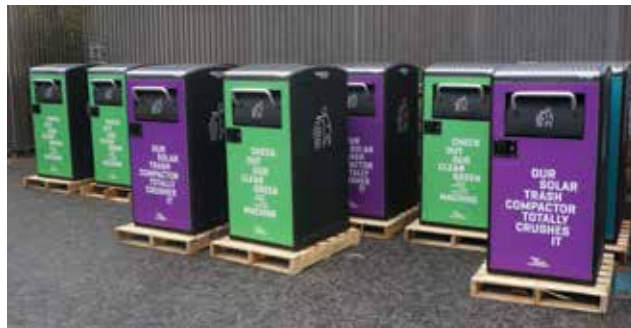
MAY USP adds ten new environmentally friendly solar-powered trash compactors to keep Union Square Park clean.