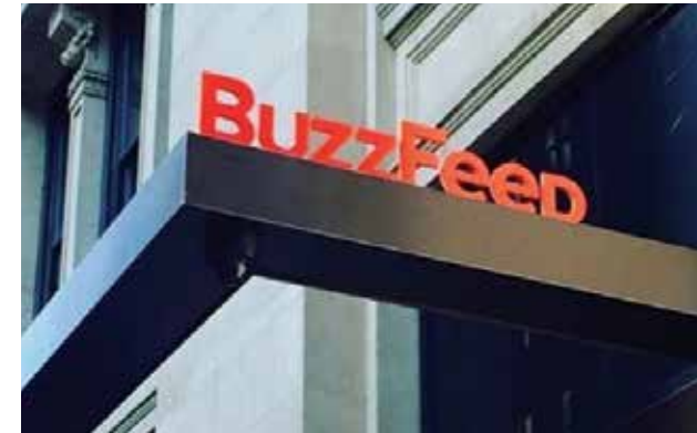
Buzzfeed and Facebook set up their new home at 225 Park Avenue South. The two tech heavy weights join the growing list of tech companies making their home in Union Square.

retailers, and healthy eateries, including Lululemon's 11,500-square-foot flagship complete with public hub and fitness workshops, and Athleta's new fitness studio. With a number of high profile retail openings in 2015, and several large-scale developments on the way, Union Square remains one of the City's strongest retail markets. Dylan's Candy Bar opened a 3,300-square-foot boutique space on Union Square West, and Banana Republic, Aritzia, Bonobos, and Paper Source joined the Fifth Avenue corridor.