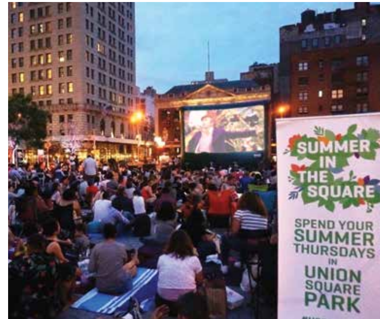
Over 1,600 people enjoyed movies on Union Square Park's North Plaza during the last two nights of Summer in the Square .

Harvest in the Square , which raised $350,000 for Union Square Park in 2015 and more than $5 million since the fundraiser began in 1996. Over 1,200 attendees came to enjoy unlimited samplings from over 45 of the neighborhood's best restaurants, each dish paired with regional wines and microbrews. To celebrate the holiday season, USP offered free professional portraits, refreshments and holiday entertainment at our 2nd Annual Picture Perfect Union Square . The festive gathering also marked the launch of the world famous Union Square Holiday Market , which drew more than 1 million visitors this holiday season.