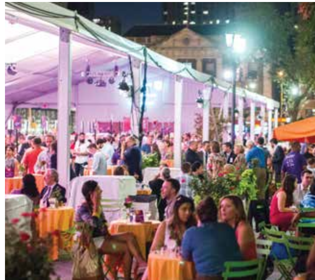
1,200 Foodies attended the 20th Anniversary of Harvest in the Square , which has raised more than $5 million for Union Square Park over the past two decades.

This year, USP expanded community programming, offering access to an even wider variety of free activities to shine the light on our neighborhood partners. We kicked off the year with the return of Union Square Sweat Fest , the wildly popular, week-long health and fitness festival highlighting the district's vibrant wellness scene. As the weather warmed up, volunteers from Con Edison and the community came out to clean up the park and get it ready for summer at 'It's My Park!' Day. Summer brought back longer days as well as USP's highly anticipated nine-week series, Summer in the Square . USP built upon the series success, offering twice the number of children's activities and performers, new fitness classes, music + dance performances and USP's first-ever movie nights. September marked the 20th Anniversary of