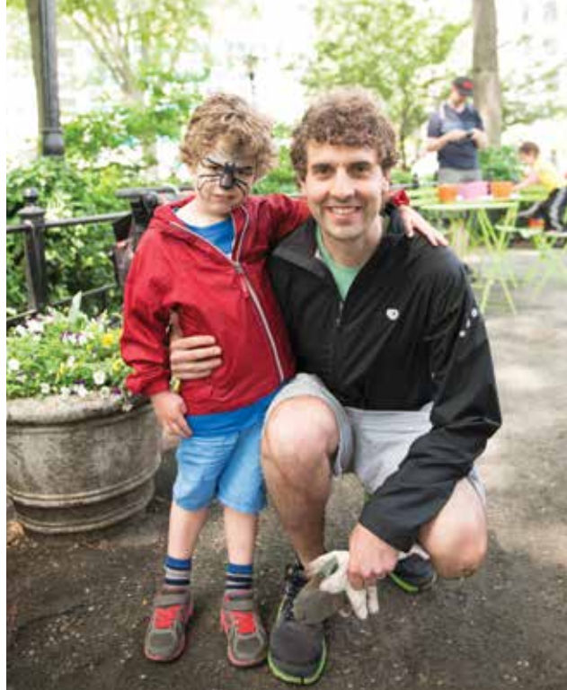
MAY Community members and volunteers from Con Edison participate in USP's park cleanup at It's My Park! Day in Union Square Park.