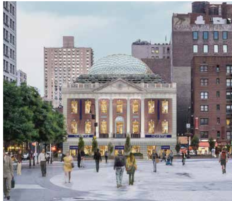
Rendering of 44 Union Square. The landmarked Tammany Hall building will be restored and modernized, bringing together commercial and streetscape improvements that are transforming Union Square Park's eastern side.

USP's extensive programming initiatives have grown in tandem with the district's rapidly expanding retail landscape. In February 2016, USP continued to showcase the neighborhood's preeminence as the epicenter for health + wellness with our 2nd Annual Union Square Sweat Fest . The event series featured over 50 studios, gyms, athleisure